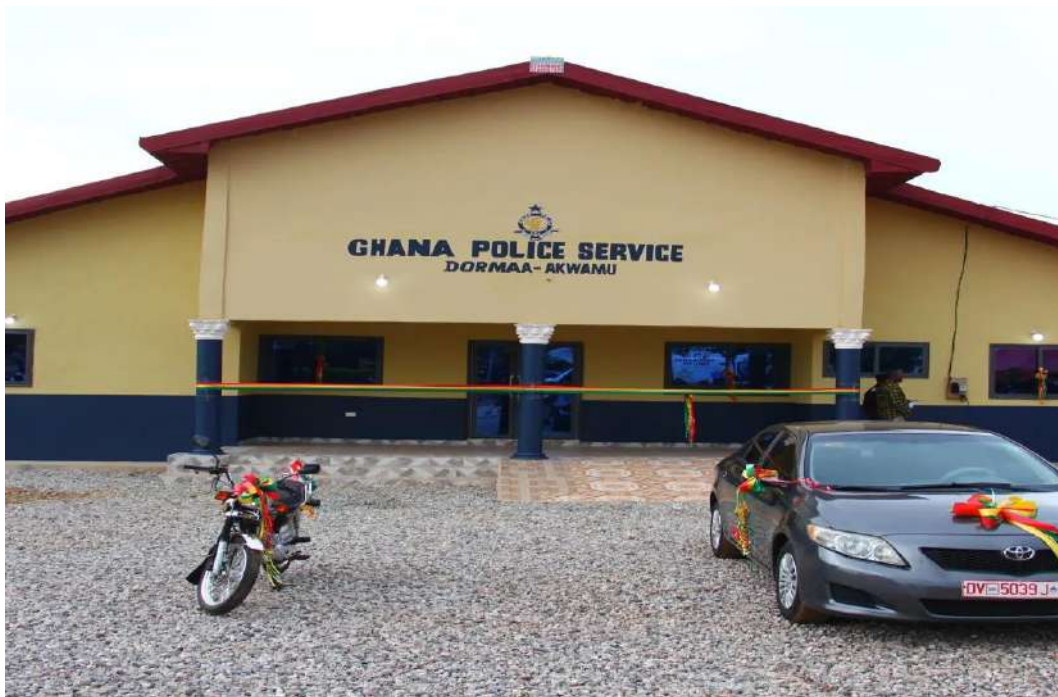
Key Achievement 2: Completed 1 No. Police Station at Dormaa Akwamu