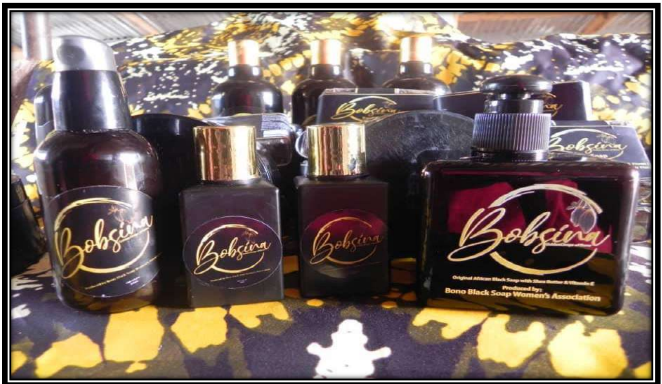
Key Achievement 6: Trained and supported 100 Women in Black Soap Production