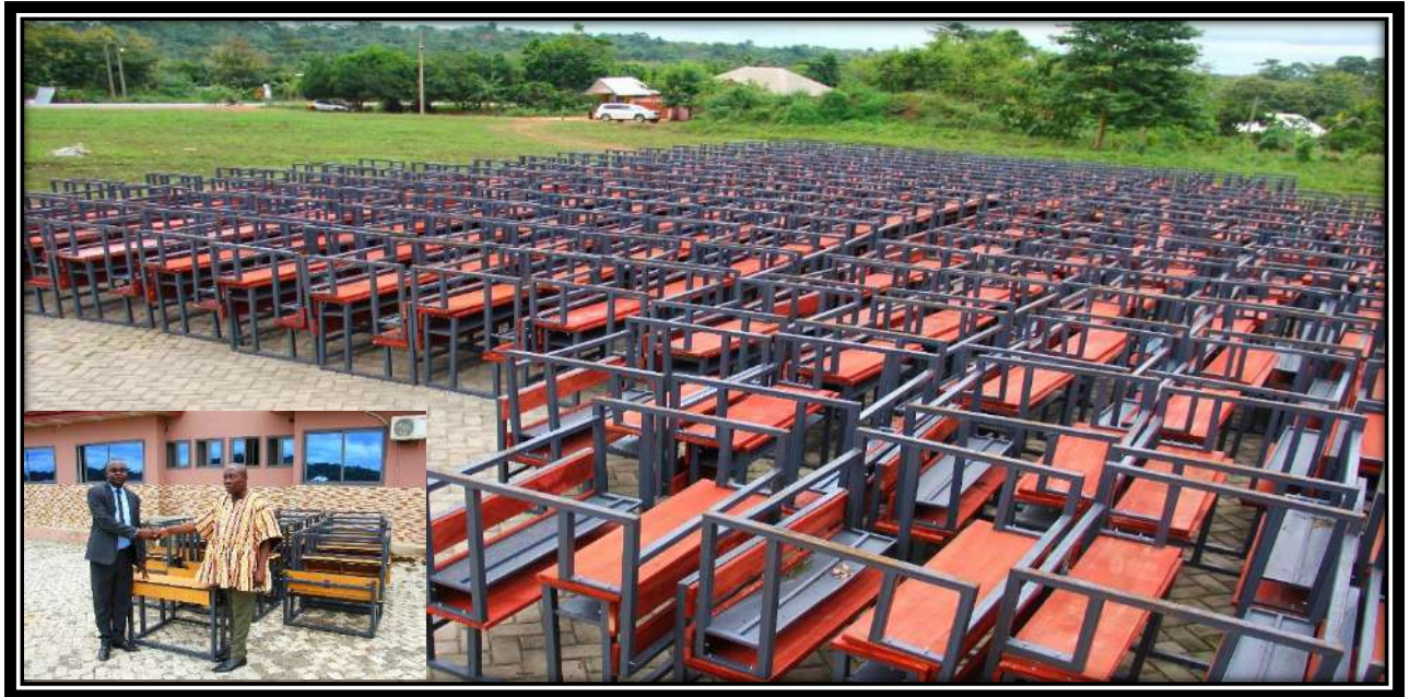
Key Achievement 5: Distributed 835 Dual Desks to Basic Schools