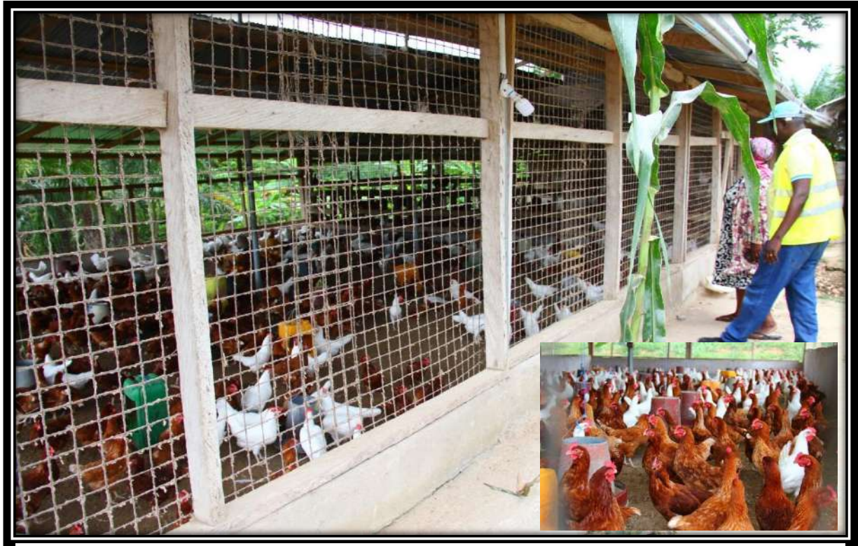
Key Achievement 7: Local Economic Development (PWD Poultry Farm-1352 Birds)