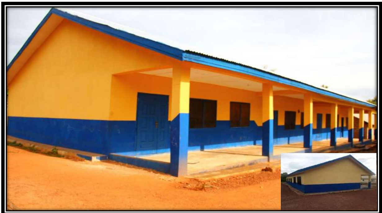
Key Achievement 4: Completed 1 No. 3-unit Classroom block for Kyeremasu SDA Primary