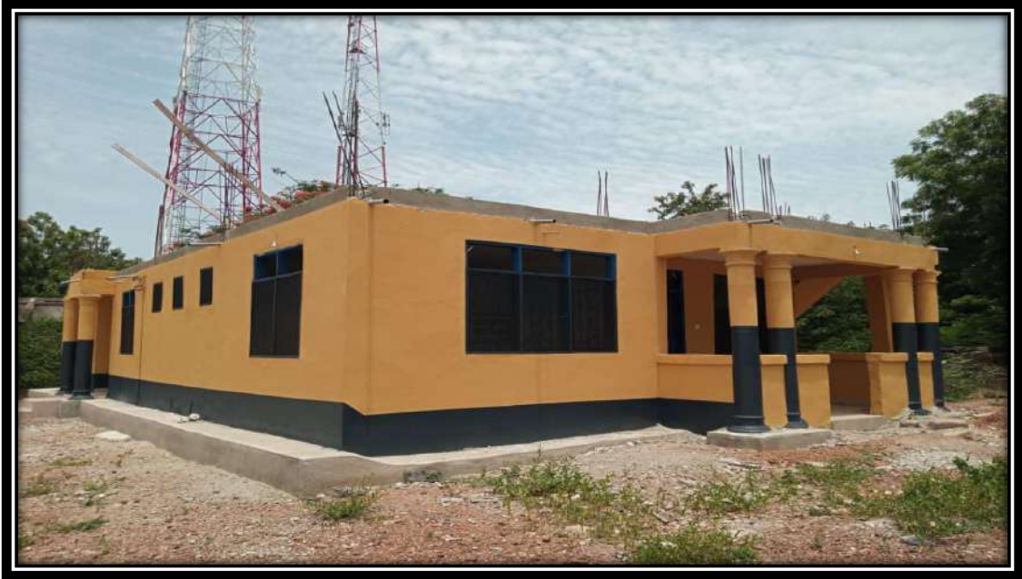
Key Achievement 1: Constructed of 1 No. Staff Accommodation for District Police Station