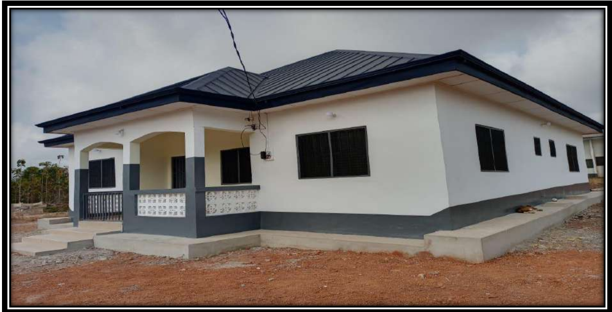
Key Achievement 3: Completed 1 No. Staff Accommodation for the District Education Directorate